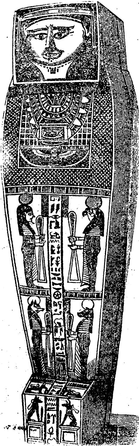
PLATE OF THE COFFIN.