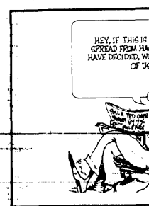
HEY, IF THIS IS WHAT 600 INTERVIEWEES OFFERED FROM SACRAMENTO, WHO ARE THE OTHER 220 MILLION OF US TO DISAGREE?