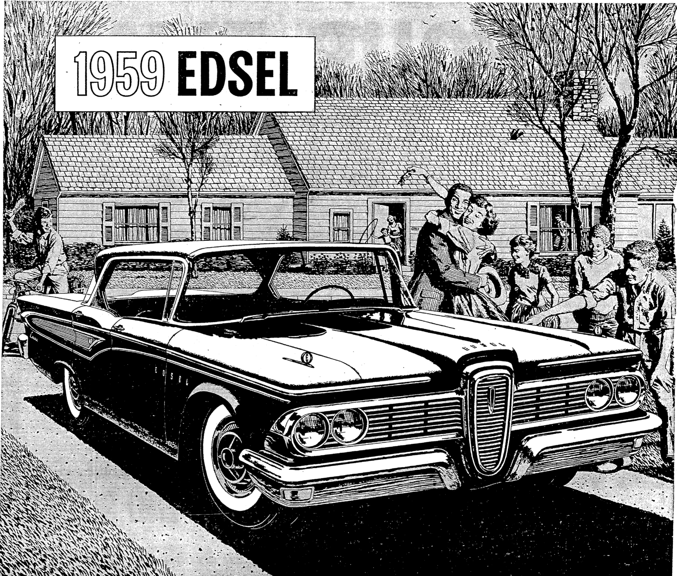
Above: Edsel Corsair 4-door hardtop

There's nothing like a Classified Ad to buy, sell, rent, hire or find. Phone BE 4-7111 to place a Want Ad.